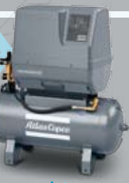
LFx Tank Mounted